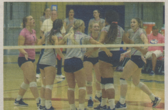
The Cougars come together after a point won to celebrate.