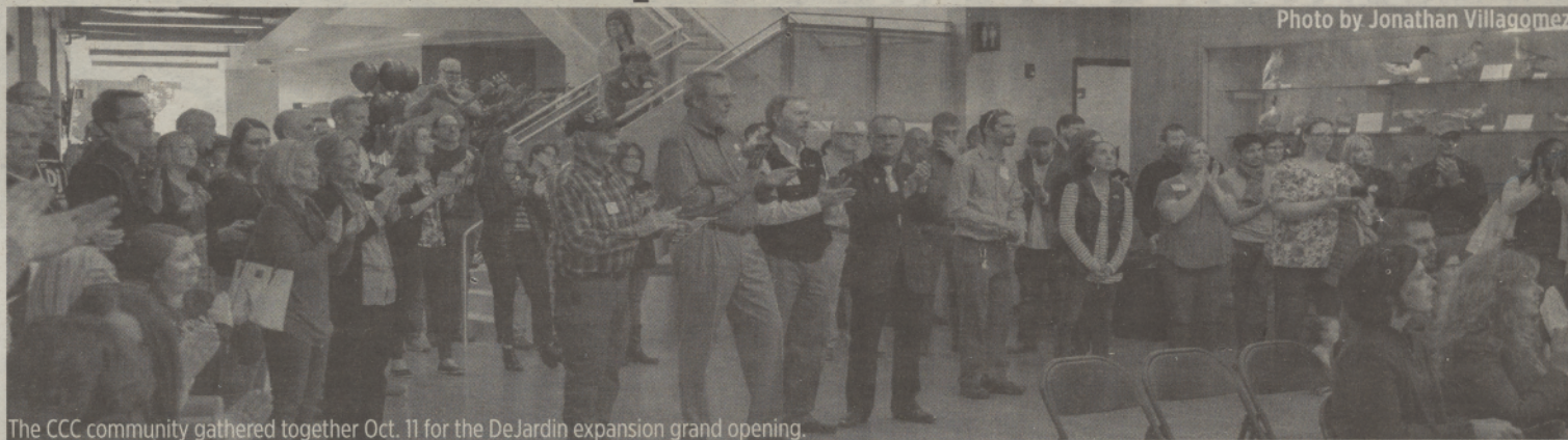
The CCC community gathered together Oct. 11 for the DeJardin expansion grand opening.