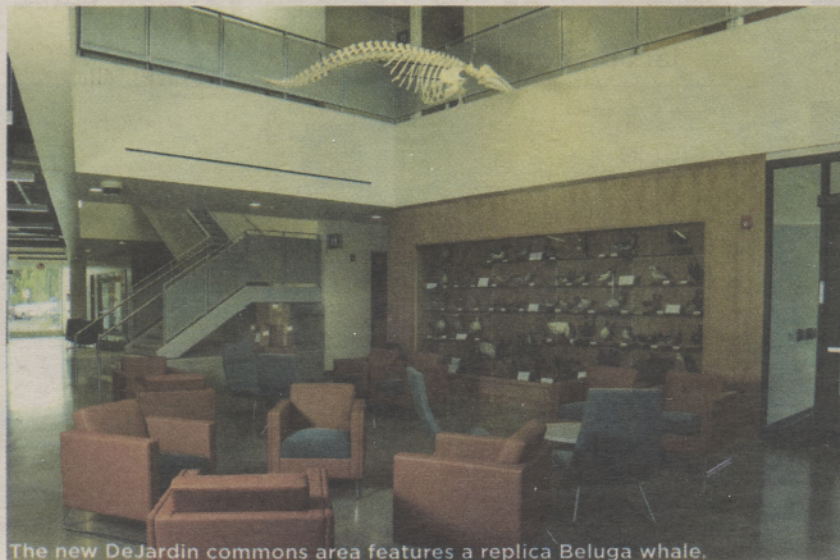
The new DeJardin commons area features a replica Beluga whale.

DeJardin Hall is located at 19600 Molalla Ave. on the Oregon City campus next to Roger Rook Hall.