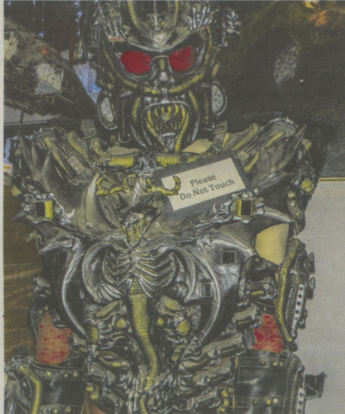
Trinkets, costumes, and other oddities line the walls of the Freakybuttrue Peculiarium.

Bigfoot, aliens, organs – all things of curiosity and creeps! Check out this week's Destitute Destinations video on theclackamasprint.com where we visited the Freakybuttrue Peculiarium, an all-in-one art exhibit, house of oddities, gags and terror located in Northwest Portland.