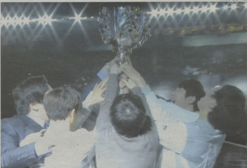
Invictus Gaming raises the Summoner's Cup, the prize for victory at the World Championship. Despite the region's dominance at other international events, this year marked the first time a Chinese team was able to take the Cup home.

Will 2019 be the year the summoner's cup finally finds a home in North America? Only time will tell.