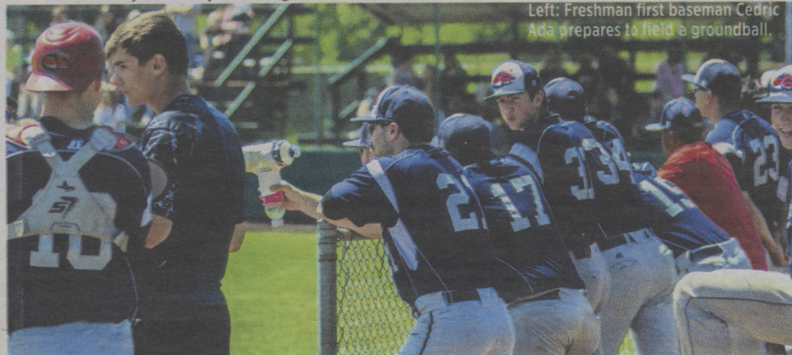
The Cougars in the dugout