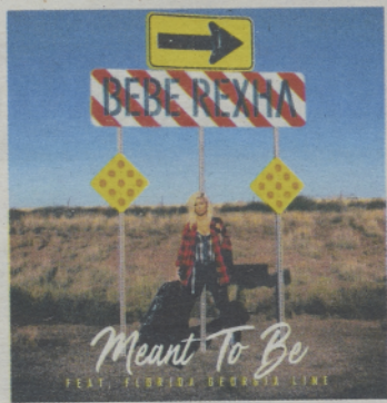
4. Meant to be by Bebe Rexha & Florida Georgia Line