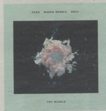
5. The Middle by Zedd, Maren Morris and Grey

A month from summer and at the top of Billboard's Hot 100 Songs list, it's safe to say we'll all be enjoying these songs on our way to the beach, out to the gorge or laying in our yards. With reports of a mid-70's average for our weekly weather report, Oregon City will begin its quick descent into the golden months of summer.