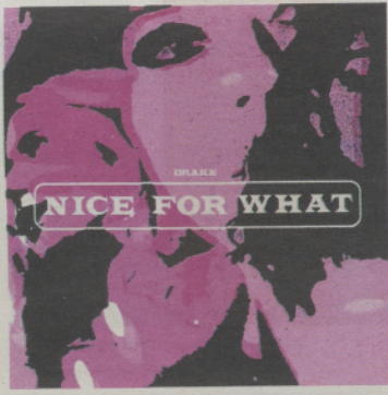
1. Nice For What by Drake