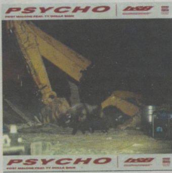
2. Psycho by Post Malone ft. Ty Dolla $ign