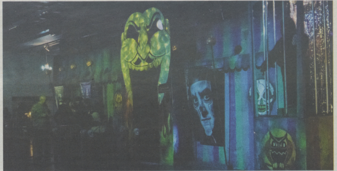
Haunted house goes wait to enter the attraction, known as one of the state's scariest spots for the season.

Grimthorne Manor, a mansion belonging to the heartless Grimthorne family, will surely make you feel right at home. Legend has it that a poor gypsy was seeking nothing but shelter and was degraded and abused by the cruel family. As she died, she placed a curse on the family, making them turn into monsters as black as their souls. Now the mansion is overrun by classic monsters such as vampires, werewolves,