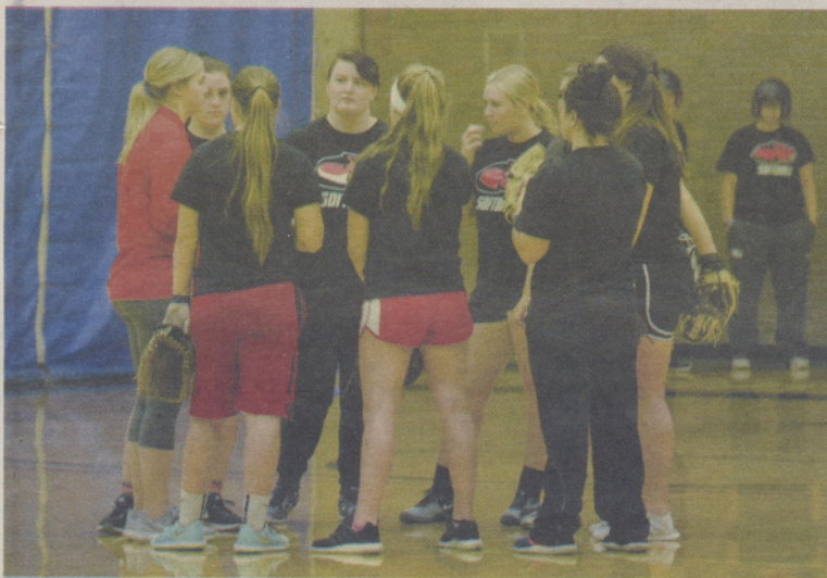
The team gathers for training in the gymnasium on Feb. 23.