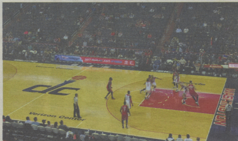
The Washington Wizards (white) play the Toronto Raptors (red) for a small crowd during an NBA preseason game on Oct. 21. The Wizards won 119-82.

Even though the home team led wire to wire, there wasn't much of a buzz from the crowd. The fans didn't seem involved in the game, and the bland PA announcer didn't help. During the game, there wasn't a lot of entertainment to get