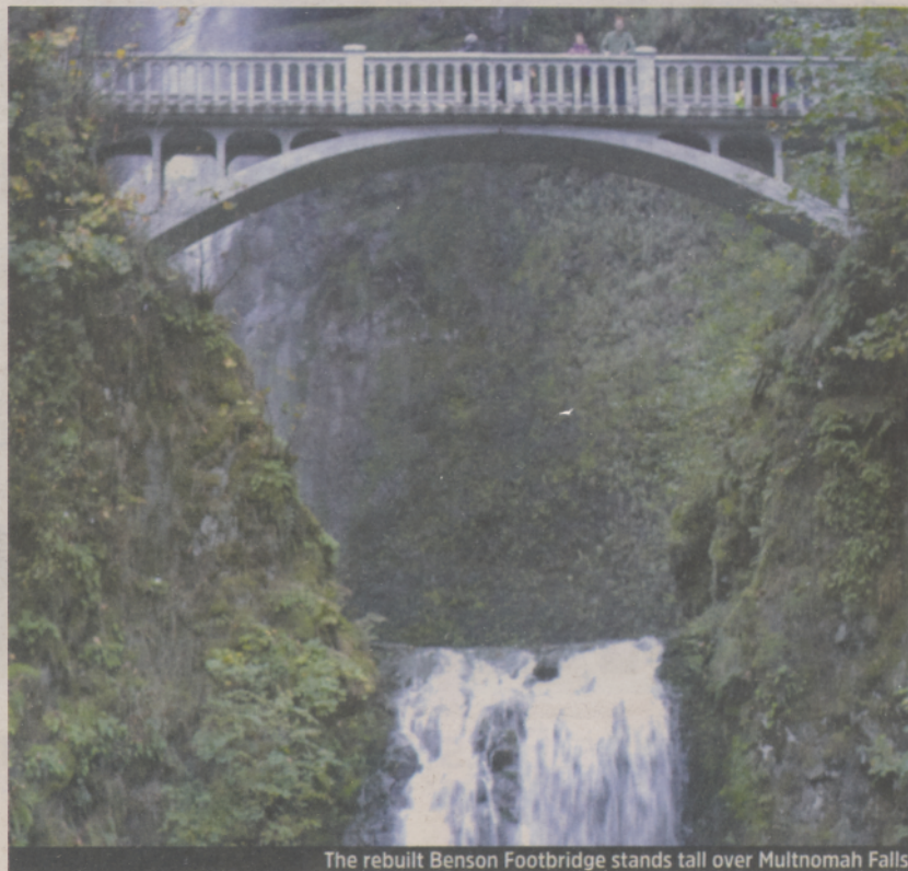
The rebuilt Benson Footbridge stands tall over Multnomah Falls.