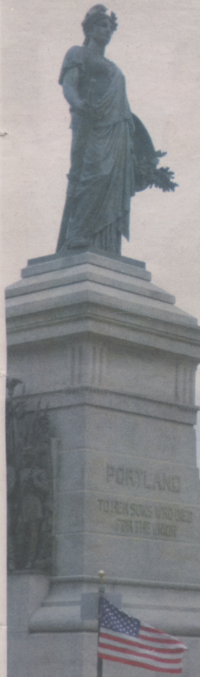
Our Lady of Victories, a prominent piece of culture in Portland, Maine, stands as a monument to Portland's soldiers and sailors of the Civil War.

A look into the people, culture and history of the two distinct cities connecting Oregon and Maine