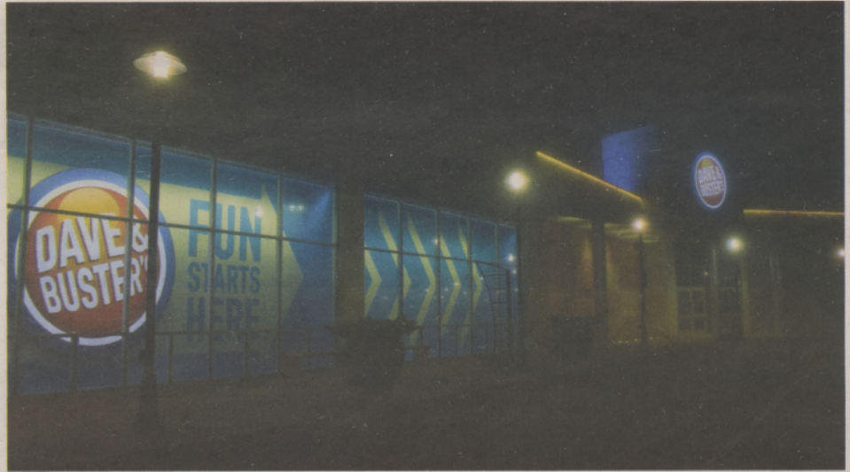
The Dave and Buster's restaurant in the Clackamas Town Center always hosts several fans during sporting events.

F ebruary is right around the corner, and with that comes everyone's favorite day. The best of the best get paired together on this day, and we forget all about our other worries and troubles on this special day.