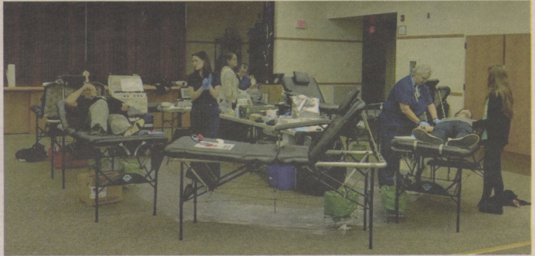
The Red Cross transforms Gregory Forum during their drives at CCC.