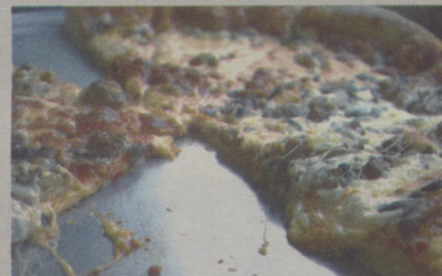
Above: Sparky's Pizza provides endless choices of topping combinations at great price ranges.