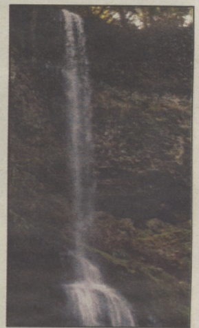
5. Winter Falls 134 ft is the last beautiful fall on the Lower Fall Loop trail.