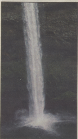
1. South Falls, 177 ft. is one of the many falls that hikers can walk behind and feel the mist from this beautiful fall.