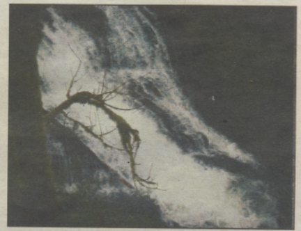
4. Double Falls, 178 ft. is the largest fall in the park.