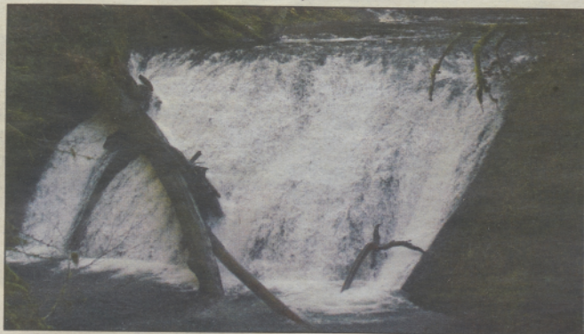
3. Lower North Falls, 30 ft. The beautiful fall is 1-3/10 mile hike from Lower South Falls.