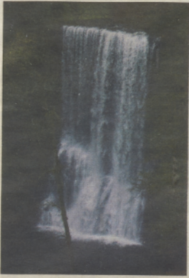
2. Lower South Falls, 93 ft. is the second fall visitors can walk behind on the trail.