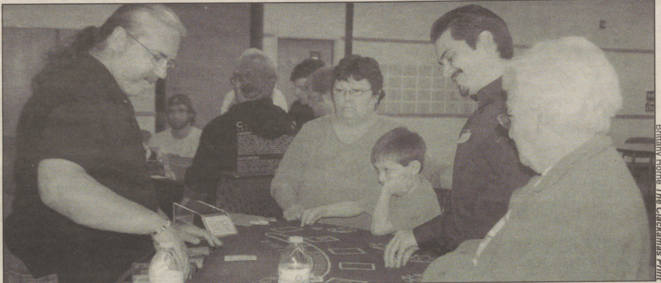
People from around the community showed up in Gregory Forum on May 18. Along with a silent auction, people played card games to help raise money Boston Marathon victims. Funds were also raised from Five Guys and Hawaiian Time eventually adding up to $813.68.