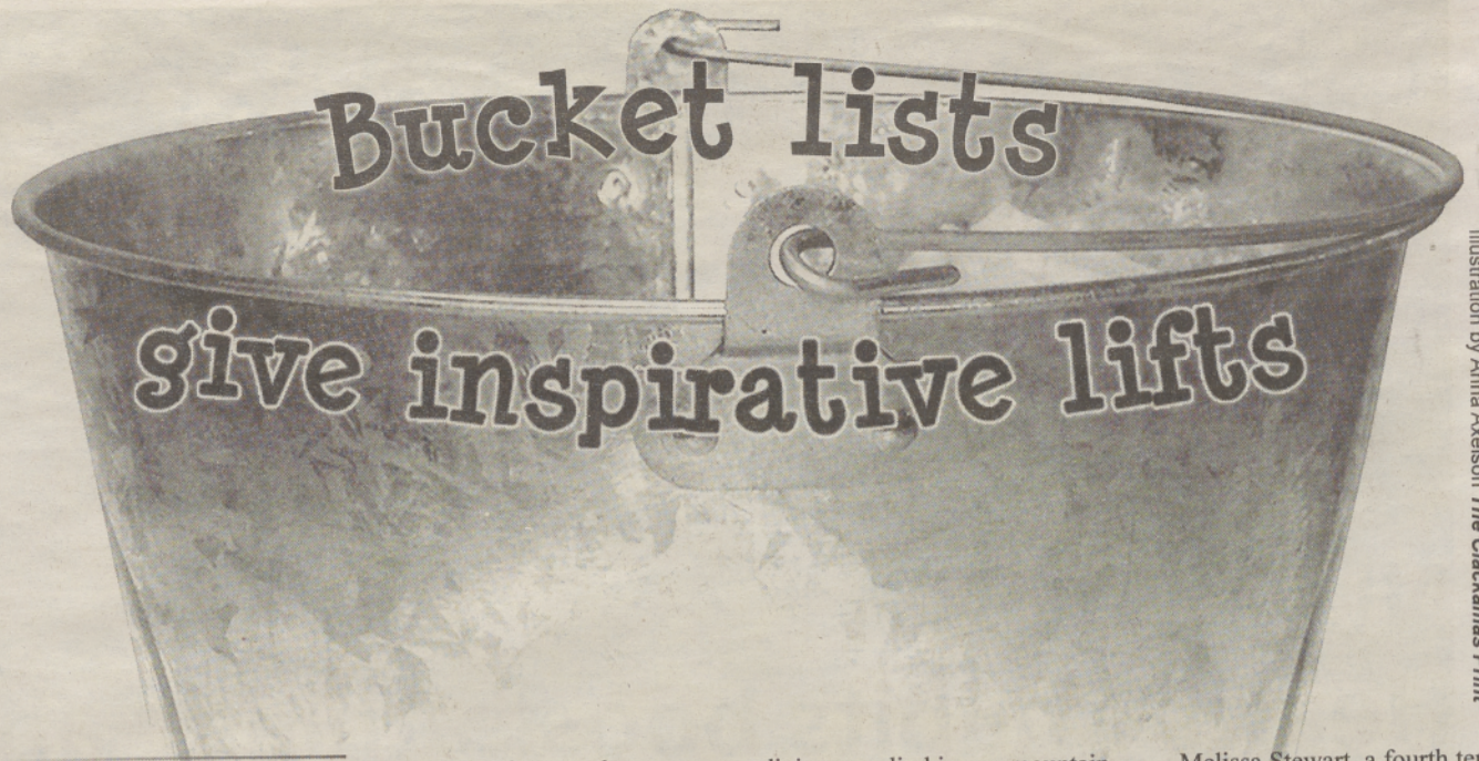
Illustration by Anna Axelson The Clackamas Print

Serve with your dipping concoction of choice or plain as to not hide any of the bacony goodness from your desperate taste buds. Either way, once you've tried them, we here at Eat, Print, Love offer your stomach a hearty "you're welcome," and bid you a kind reminder to share (though as it IS bacon, for sheer peace of mind sharing is not required or recommended).