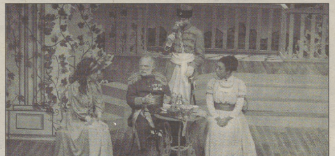
During Act II, the Petkoff family, along with Sergius Saranoff, sit in the garden of their house to enjoy breakfast. During breakfast Sergius talks about his journey at war and a family who hid away a Swiss Mercenary, which was exactly what Raina and Catherine Petkoff had done.

The play will open on Feb. 28 and will continue through March 10 at the Osterman Theatre located in the Niemeyer Center at 7:30 p.m. with Sunday Matinees at 2:30 p.m. Also, on Feb. 28 from 4:30 to 6 p.m. there will be a behind the scenes tour when anyone can discover how it all happens behind the curtains.