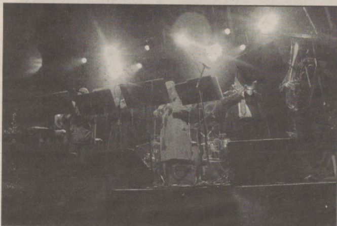
Above: Pink Martini and Friends lead Pioneer Square in hours of caroling, launching the season of holiday cheer and family-gathering festivities. The band played until the final countdown of the lighting of the tree. Top right: The tree that lit up Pioneer Square stands tall in Portland.