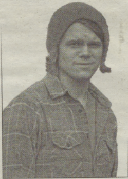
By Isaac Soper Arts & Culture Editor

I quickly turned off my headlamp and my backpacking stove as I noticed the blaze of a security guard's flashlight blanketing the darkness. May 2 was my first night of "guerrilla camping."