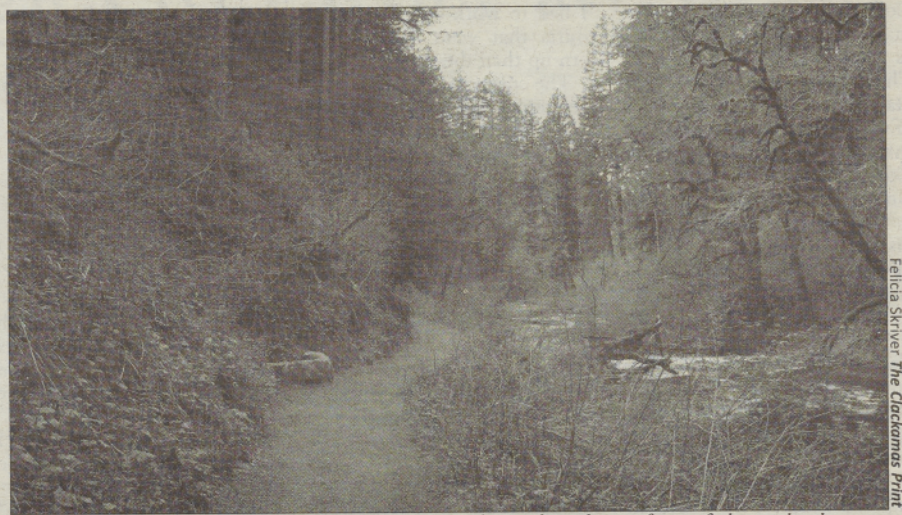
Silver Falls State Park is Oregon's largest state park. Within the confines of the park, there are numerous hiking and biking trails, including a trail called the "Trail of Ten Falls."