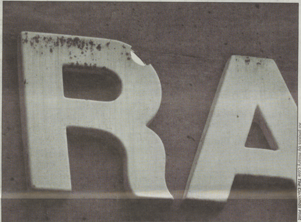
The "R" in Randall is a sign of the age and repair need of the building, which was officially opened in 1972. The college is hoping to do more repairs on the building this spring.