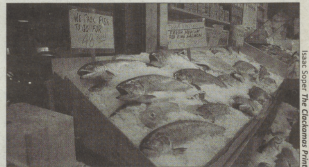
Isaac Soper The Clackamas Print