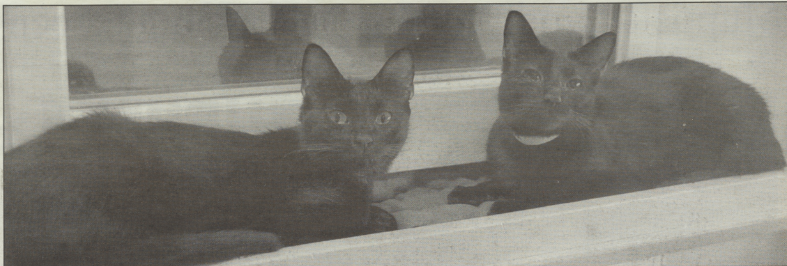
Two black cats lounge around at the Oregon Humane Society. These friendly felines are two of the 98 recently rescued from a hoarder's home. The Humane Society offered half price adoption fees for Black Friday for any black cat, six months or older. The Humane Society houses all kinds of different animals that are always available for adoption.