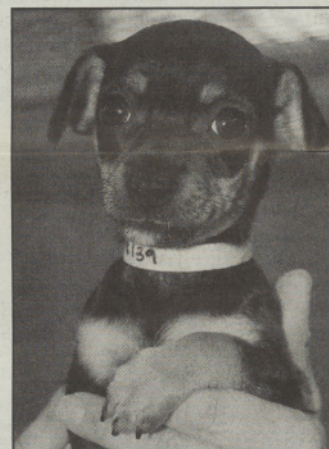
Holiday, a chihuahua mix, is just one of the many homeless pets hoping to find a new home this season.

Animals are up for adoption year round, there's no need to hesitate in bringing a lonely cat, dog or even rabbit home for the holidays.