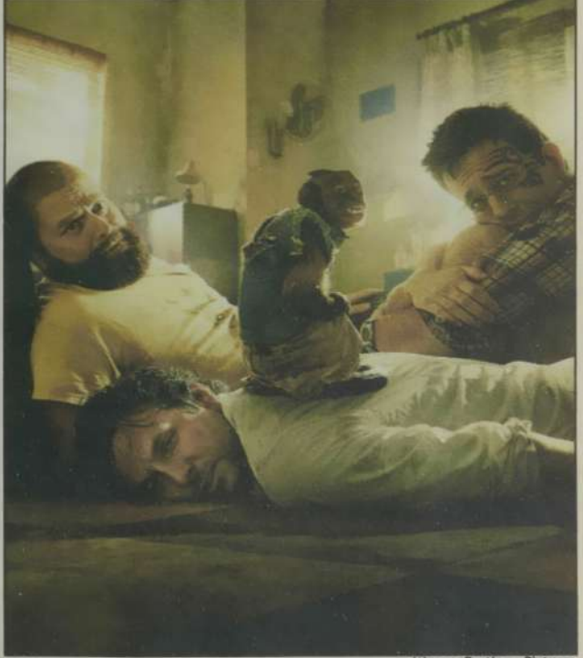
Warner Brothers Pictures