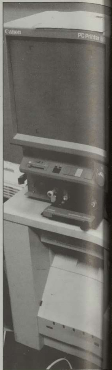
This unused vintage microfilm reader rests in the Business Office.

If the motion is passed on Nov. 10, the Business Office will immediately adopt the amended policy, but the first public sale date is unknown until Campus Services inventories how much surplus they have to warrant a sale.