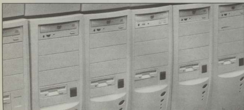
John Petty Clackamas Print Computer towers are stacked in the ASG office, waiting to be dispersed among students applying for computer grants. See article below for more information.