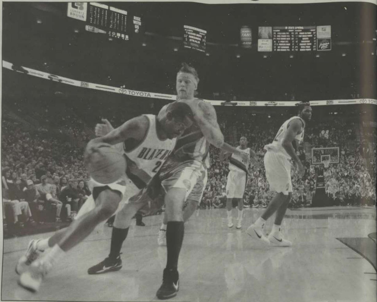
Above: Martell Webster makes a move towards the basket around the Nuggets' Chris Andersen. Webster finished with 20 points in 20 minutes of play. Below left: Joel Przybilla puts pressure on the Nuggets' Kenyon Martin at the top of the key.

McMillan said of the night, "What I really liked from our guys tonight was we were down ten in the fourth and I remem-