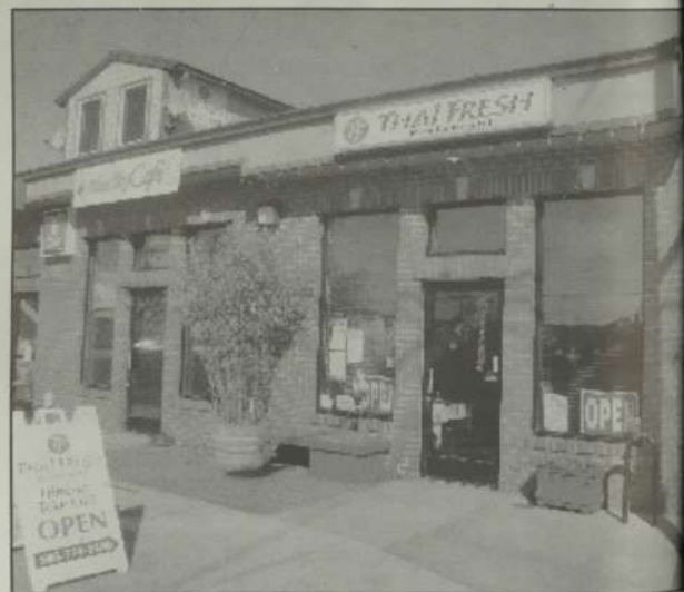
The tiny Thai Fresh, 8409 S.E. Division St. in Portland leaves a big impression on those willing to give it a