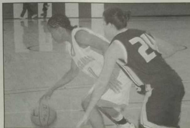
Right: A Clackamas player drives to the hoop in a game against Walla Walla Community College.