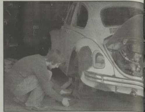
Full-time student Alan Shufelt takes apart assembly on a 1969 Volkswagen Beetle.

"Car maintenance is easier to maintain today than in the past," Goloback said.