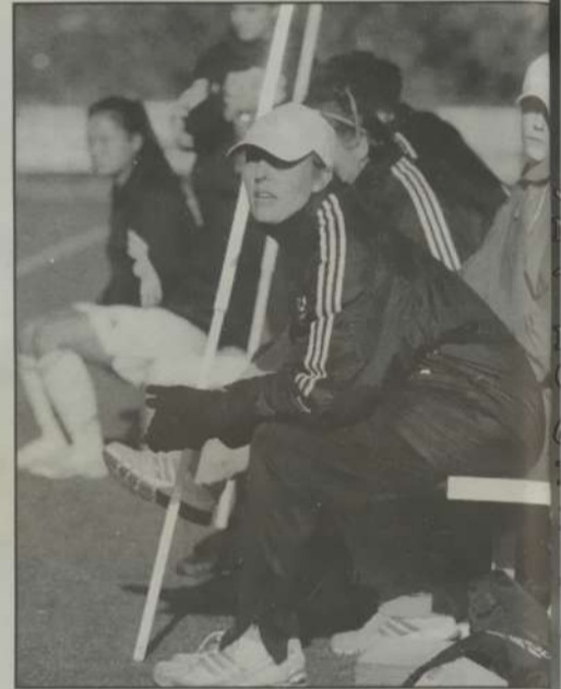
All photos contributed by Tracy Swisher - FotoZoneonline.com