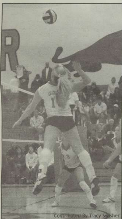
Contributed By Tracy Swisher