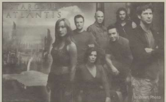
The city of Atlantis in the Pegasus galaxy, with the explorers who came from Earth in the show Stargate Atlantis .

Tune in to these shows; they are well worth the watch. Television this fall has really stepped up to the plate to bring many great new programs.