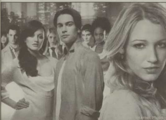
The glamorous cast of new CW show Gossip Girl , which is set in a Manhattan backdrop.