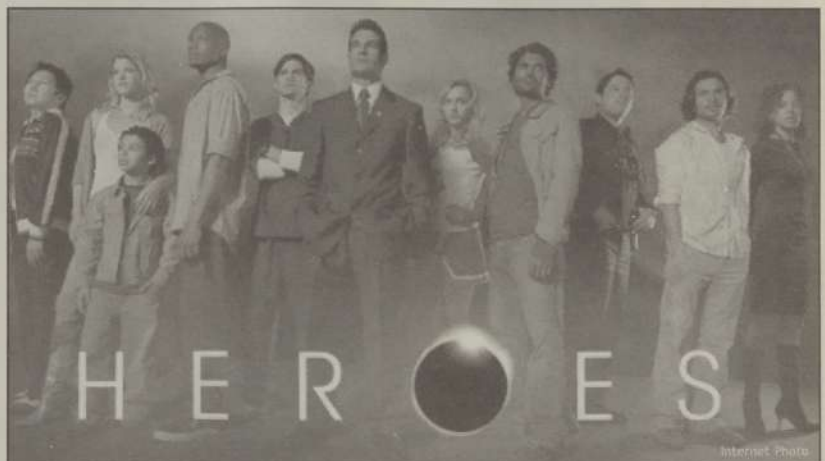
The "superheroes" have returned to television for a second season on NBC. Heroes airs Monday nights at 9 p.m. and on Saturday nights at 8 p.m.