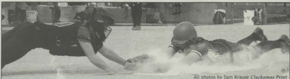
A Lady Cougar attempts to evade the tag from the opposing catcher as she slides head-first into home during the game vs. Highline CC.

Northwest Commission on Colleges and Universities accredited 17600 PACIFIC HIGHWAY (HWY. 43) MARYLHURST, OREGON - JUST 10 MINUTES SOUTH OF PORTLAND Serving students since 1893. www.marylhurst.edu 800.634.9982