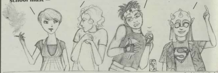
By Megan Koler

di-ver-sion n. 3. an attack or feint that draws the attention and force of an enemy from the point of the principle operation