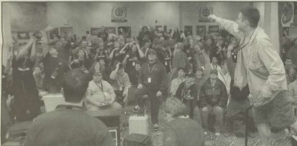
A staff member tosses schwag to a crowd of about 500 gamers. There were many prize give-aways that took place throughout the entire LAN event, most of which were supplied by sponsors.

The next PDXLAN event will take place in late August of this year. There are still plenty of seats available, and reservations are only $60. To register, visit www.pdxlan.com .