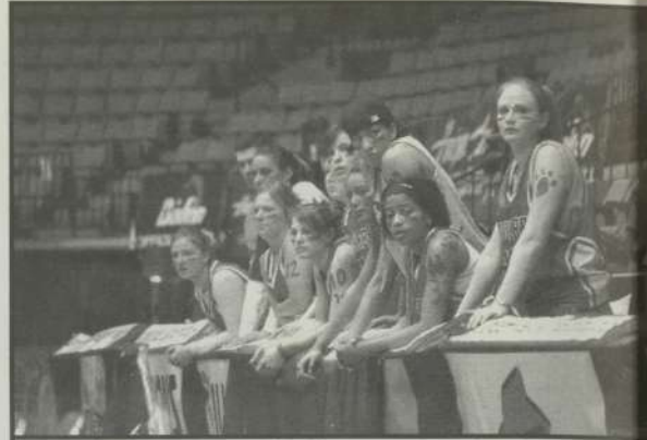
The Clackamas women's team roots for the men during the championship game in Kennewick, Wash.

The Family Resource Center at Clackamas will be giving away fundraiser vouchers on Sat., March 11. The Oregon City Pizza Hut will donate 20 percent of the day's purchases made with those vouchers to the YMCA Strong Community Support Campaign. For more information, call 503-657-9795.