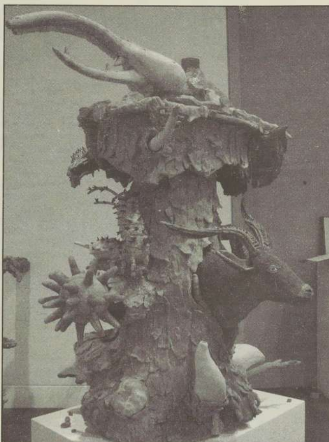
Adam J. Manley Clackamas Print

In the end, the theme of the exhibit is a resounding failure. But the art - from classic to modern to the utilization of video projection - remains nothing short of gorgeous. Just don't read the plaque.