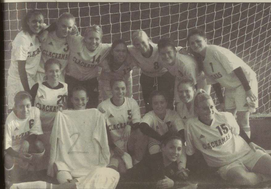
Clackamas 2005 Soccer Team