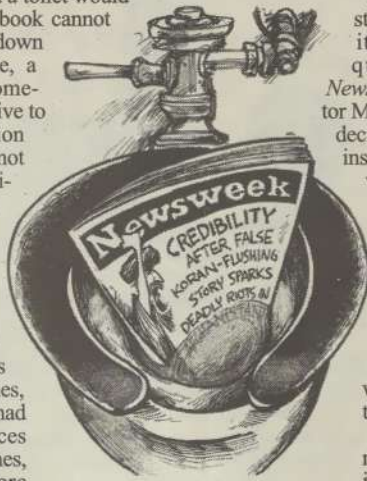
Illustration courtesy of capmag.com

Newsweek's feeding into this illogical, ignorant hatred not only risks their reputation, it costs lives. The media should seek to serve the people with news and care enough to realize that stories like the "Koran desecration" are only fuel for a fire of hate.