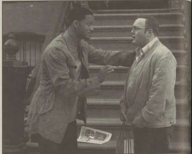
Smith, the "Date Doctor," gives his clueless client (James) a few much-needed dating tips in hopes he'll catch his million-dollar heiress.

All in all, this movie is fresh, different, and hysterical. Very rarely do movies make me laugh deep down, but "Hitch" accomplished just that. This is definitely a great date movie. I'd advise everyone to go see this hilarious movie about how love strikes in unexpected ways.