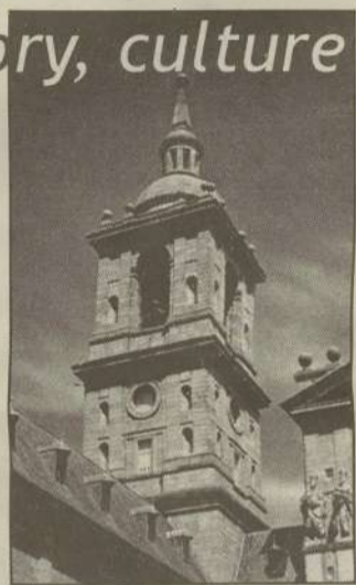
San Lorenzo de El Escorial is one of many sites to see on the '05 trip to Spain and Portugal, which is open to all students.

They are also having two informational meetings, both of which are in McLoughlin Hall. The first is on Wednesday, Feb. 9 from 5:15-6 p.m. and the second is on Friday, Feb. 11 from noon-1 p.m.