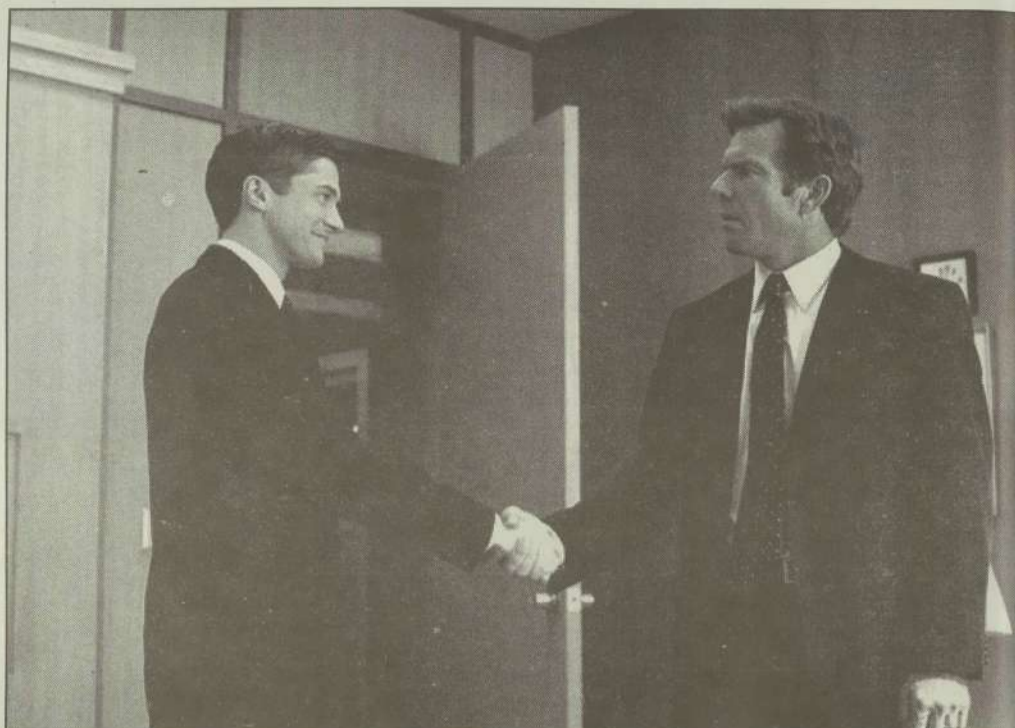
Quaid meets Grace, his new boss and his daughter's new boyfriend, in "In Good Company," movie about two men who are unwillingly drawn together in their personal and business lives.

Beside all the fundamental "great film" attributes present, what really put the movie over the