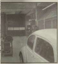
Ferguson Clackamas Print

The program invites those who have an interest in cars, just want to learn how to do the basic work needed on a car, or even have no interest in cars but have an interest in the artistic side. Class registration opened yesterday, so sign up now.