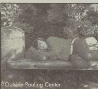
Outside Pauling Center