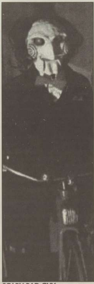
SCARY BAD GUY INTERNET PHOTO

Not only does it surpass horror flicks, however, but it is also far different from other serial killer movies. Unlike Hannibal Lector