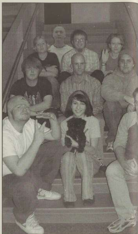
Meet the Clackamas Print Editorial staff!