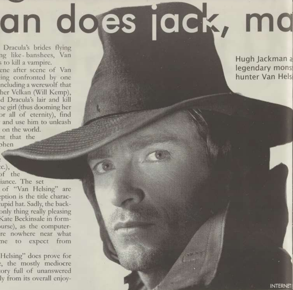
Hugh Jackman as legendary monster hunter Van Helsing

While overall "Van Helsing" does prove for an entertaining movie, the mostly mediocre visual effects and a story full of unanswered questions detract heavily from its overall enjoyability.