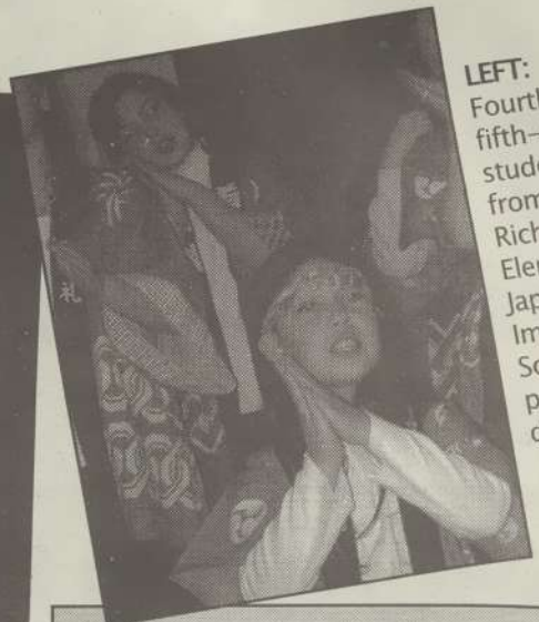
LEFT: Fourth and fifth-grade students from Richmond Elementary Japanese Immersion School perform a dance.