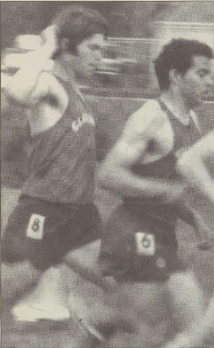
The Clackamas track team hosted a number of events on April 17 at the CCC Open. Between the men's and women's teams, Clackamas was able to win eight individual events as well as two relays. This Friday, the Clackamas runners will participate in the Western Twilight in Monmouth.